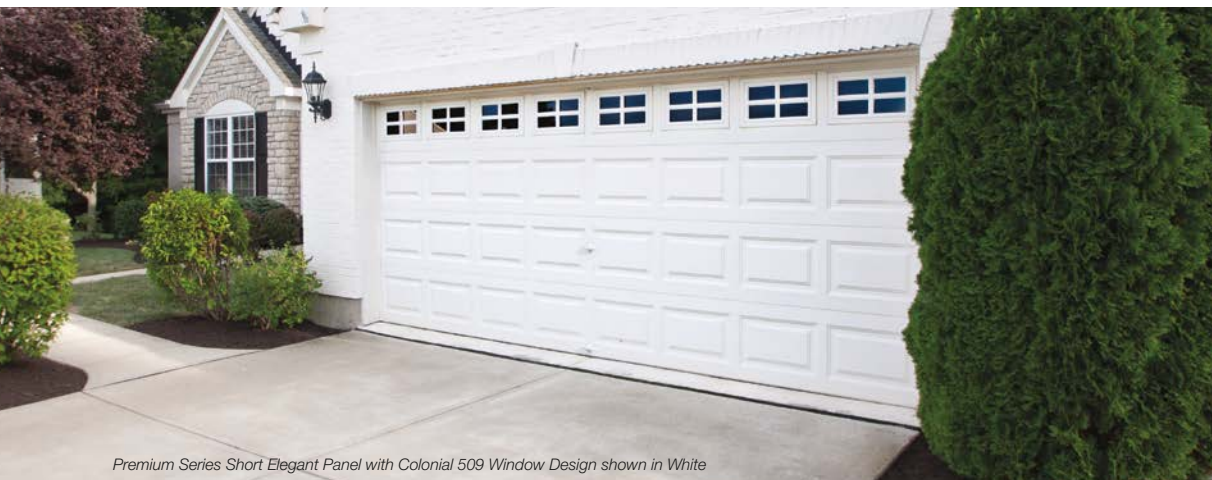
Premium Series Short Elegant Panel with Colonial 509 Window Design shown in White