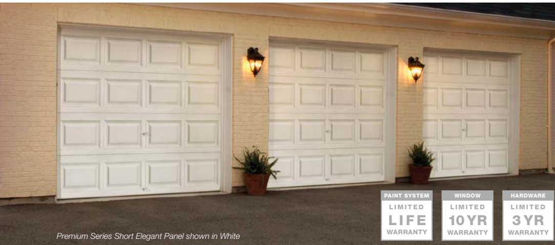
Premium Series Short Elegant Panel shown in White